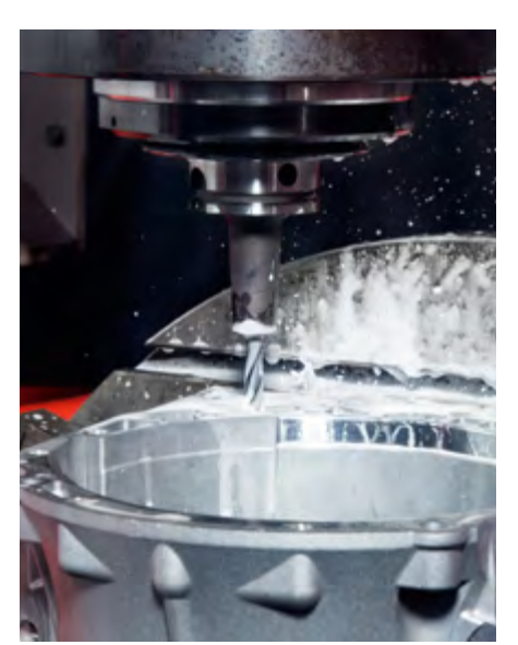
Finely-dispersed BECHEM Avantin formulations enable minimal coolant lubricant discharge through excellent flow behavior.

When processing sensitive aluminum materials, BECHEM Avantin produces high-precision surfaces, e.g. in demanding internal machining processes of shock absorber tubes. In this regard, the suitable combination of the right coolant lubricant with the used high-performance tools is crucial for the result. BECHEM Avantin also ensures maximum efficiency and sustainability in the manufacturing of innovative transmission components. Just two examples for pioneering BECHEM technology.