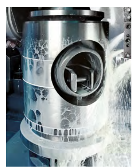
Large bore piston manufacturing with BECHEM Avantin

BECHEM Avantin stays cool even when things get hot. Processes that involve high thermal loads are ideally supported by oxidation resistant, semi and fully synthetic product concepts. With minimal consumption, BECHEM Avantin impresses by excellent cooling, outstanding corrosion protection, and excellent removal of process materials.